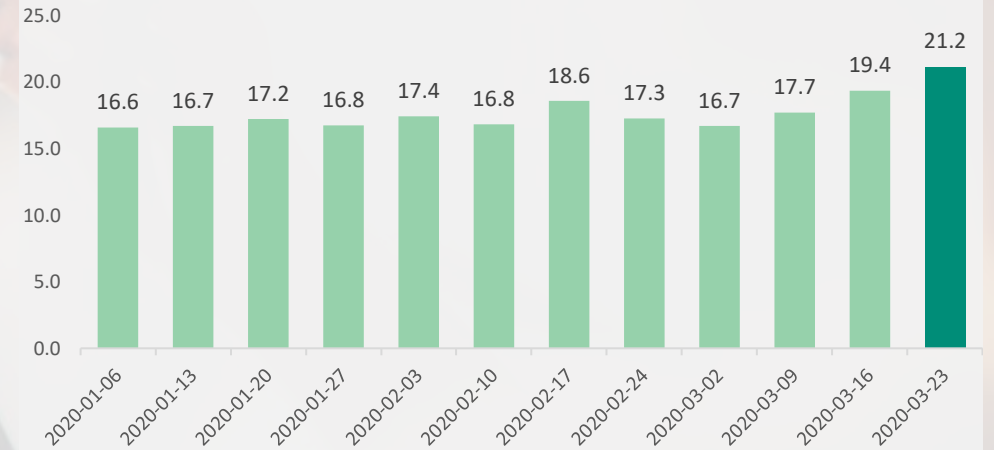
Ave Weekly Streams for Netflix HH